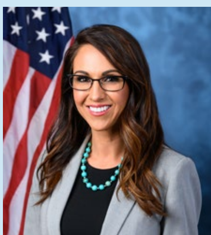
Rep. Lauren Boebert @laurenboebert

“The Democrats are willing to shut down the country to give illegal aliens healthcare. They want to shut down the government which will hurt our troops, seniors, and veterans for illegal aliens. They never cared about the American people.”